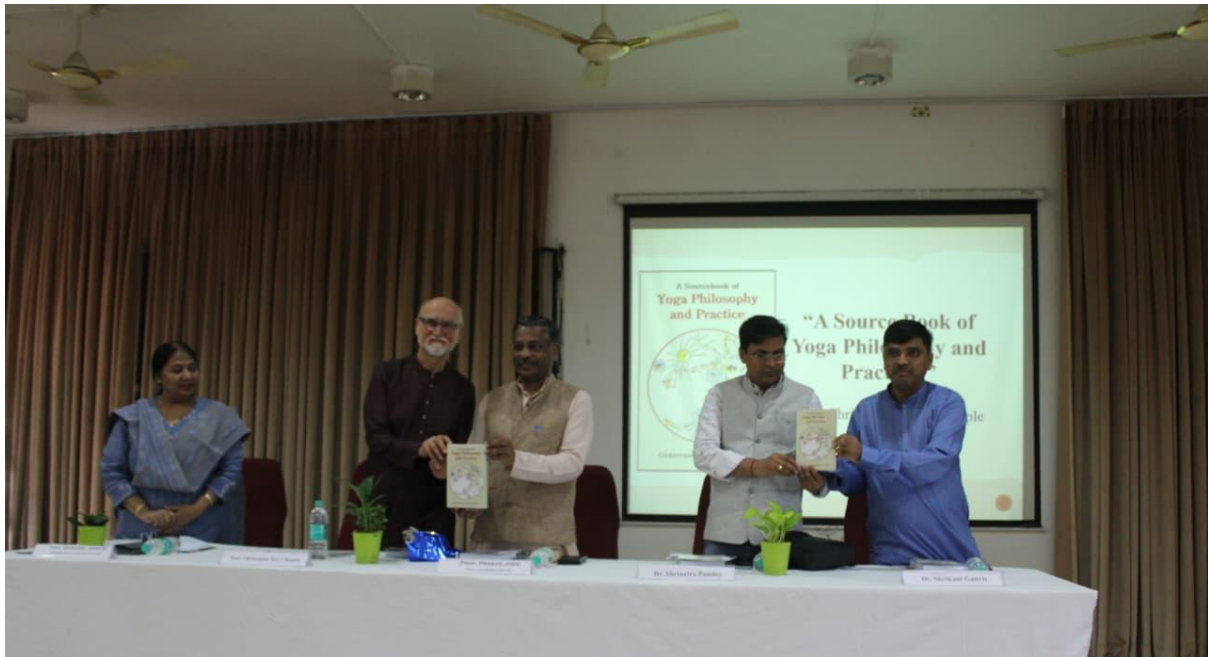
Inauguration of "A Source Book of Yoga Philosophy and Practices"