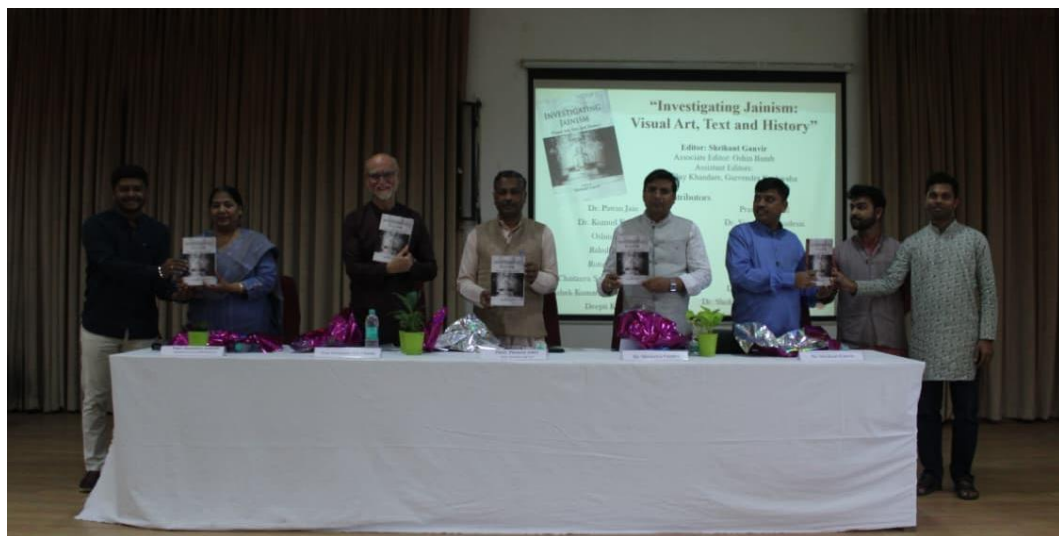
Inauguration of "Investigating Jainism: Visual Art, Text and History"