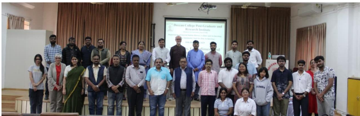
Group photo after the vote of thanks